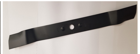
(STANDARD MULCH BLADE)