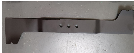
Part no. 2105200274A (HIGH LIFT BLADE)